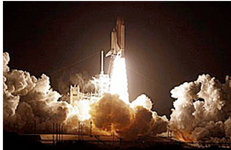
Space Shuttle Endeavour lifts-off from the Kennedy Space Center at Cape Canaveral, Fla. Monday Feb. 8, 2010. Endeavour's six member crew will deliver a large room with a cupola to the International Space Station.