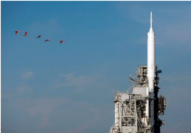
NASA's Ares I-X rocket sits on launch pad 39-b at the Kennedy Space Center.

The Obama administration plans to kill a program to return astronauts to the moon, the Orlando Sentinel reported Wednesday, quoting unnamed White House officials.