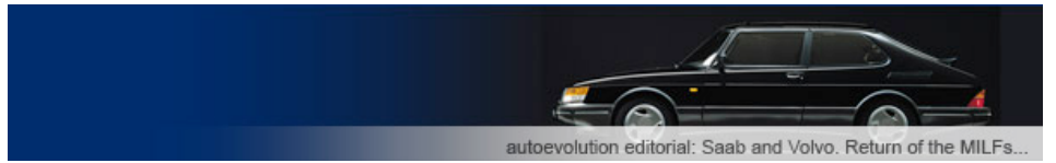
autoevolution editorial: Saab and Volvo. Return of the MILFs...