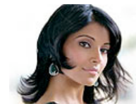
Bips' sizzling act at awards show