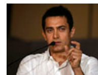
IPL row: Aamir bats for SRK