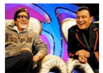
Big B on Dance India Dance