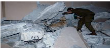
January 16, 2010 A car the size of a toy from the ICF (Interim) Unit and his dog in the ruins of the Mark III