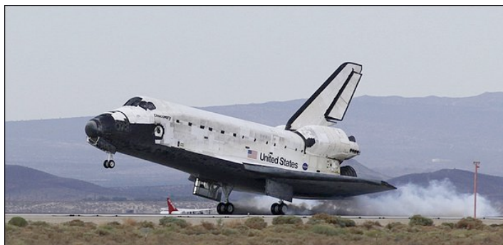
NASA will sell its 1970s-era spaceships once retired from service in the coming years.