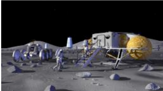
This is an artist's concept of a small lunar outpost.

(PhysOrg.com) -- Space seems exotic, forbidding, and remote, but imagine trying to survive winter without a heated shelter or warm clothing. Our ancestors developed these technologies because they needed room to grow; without them, we would still be confined to narrow areas along the equator, but with them, we could