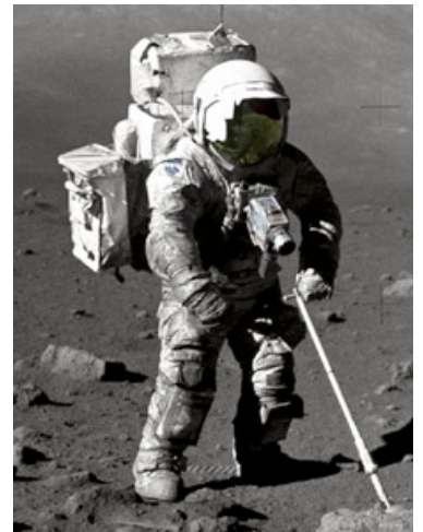
Geologist-Astronaut Harrison Schmitt, Apollo 17 lunar module pilot, uses an adjustable sampling scoop to retrieve lunar samples during the second extravehicular activity (EVA-2), at Station 5 at the Taurus-Littrow landing site. The cohesive nature of the lunar soil is born out by the "dirty" appearance of Schmitt's space suit.

Since lunar dust doesn't conduct electricity well, objects on the lunar surface tend to retain their charge. As a result, the same