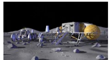
This is an artist's concept of a small lunar outpost.

The same particles also come from distant regions in our galaxy or even farther beyond. Sources like exploding stars and high-speed jets near black holes are believed to generate these cosmic rays.