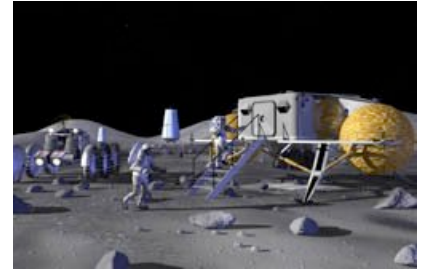
This is an artist's concept of a small lunar outpost.

"For instance, the simple large-tolerance mechanical devices on the Rover began to show the effect of dust as the EVAs [Extravehicular Activities or moonwalks] went on. By the middle or the end of the third EVA, simple things like bag locks and the lock which held the pallet on the Rover began not only to malfunction but to not function at all. They effectively froze. We tried to dust them and bang the dust off and clean them, and there was just no way. The effect of dust on mirrors, cameras, and checklists