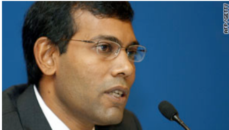
Nasheed: U.S. President John F. Kennedy chose to go to the moon. Our generation must choose to remain on planet Earth.

By Mohamed Nasheed , Special to CNN December 7, 2009 2:25 p.m. EST