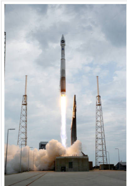
Cape Canaveral, FL.

This mission launch was competing with Space Shuttle Endeavor's schedule, since a hydrogen leak and weather had delayed it a few times. It was an accomplished summer for NASA, but was fraught with numerous delays, mainly from bad weather. See more, here, or slide shows below.