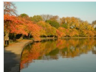
Fall Foliage Pictures around Washington DC and Arlington VA