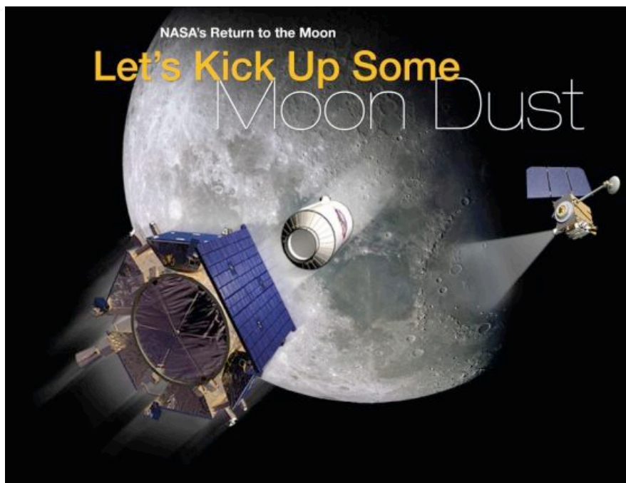
Detail of a NASA poster depicting an artist's view of Friday's kamikaze rocket to the moon's surface.