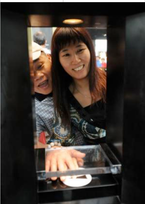
Tourists get a chance to touch a piece of a Moon Rock at the Smithsonian Air and Space Museum's "Apollo to the Moon" exhibit on July 20, 2009 in Washington, DC. Today is the 40th anniversary of astronaut Neil Armstrong's first walk on the moon via Apollo 11, on July 20, 1969. The Apollo 11 crew was Armstrong, Buzz Aldrin and Michael Collins. | Enlarge