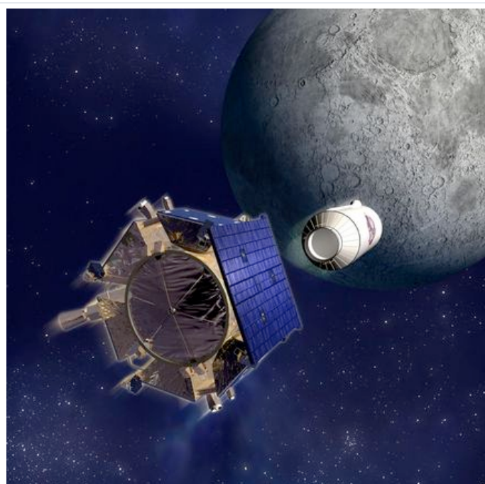
NASA released Lunar Crater Observation and Sensing Satellite mission photos.

By Shelby G. Spires October 17, 2009, 2:10PM