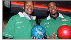
Paul Pierce and Ray Allen trade slam dunks for strikes