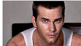
Tom is featured in Details, GQ