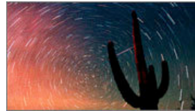
Actually, it's the Leonid Meteor Shower