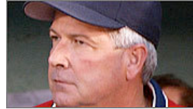
Boston sports' worst coaching decisions