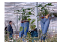
Agricultural Hi-tech Fair opens in NW China