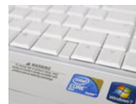
NY's attorney general files antitrust lawsuit against Intel