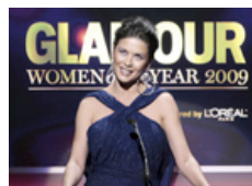
Glamour's Women of the Year 2009