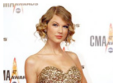
43rd annual Country Music Association Awards held in Nashville