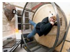
Having a taste of sleeping in "Hamster's Villa" Nashville