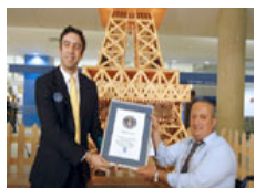
Matchstick Eiffel tower grabs Guinness Record