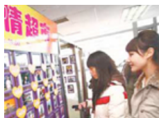
Singles' Day a chance for romance