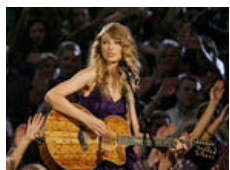
Taylor Swift makes history at CMA