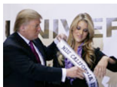
Trump says Carrie Prejean "should be ashamed"