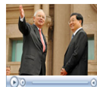
President Hu Jintao continues Asian tour