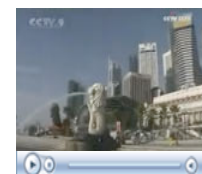
China-Singapore ties remain strong