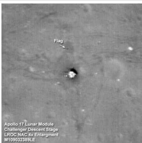
Apollo 17 from the LRO

5 comments Print Email RSS Subscribe Previous Next