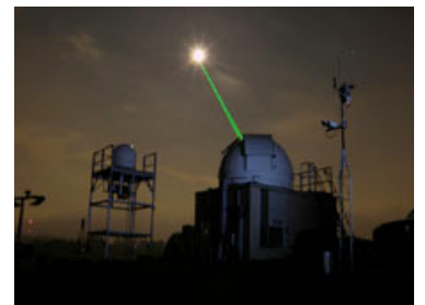
Goddard's Laser Ranging Facility from another side.