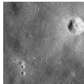
An uncalibrated LROC NAC image of the Apollo 14 landing site and nearby Cone crater released on Aug. 19, 2009. The trail followed by the astronauts can clearly be discerned. Image width is 1.6 km