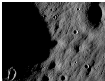
Lunar Reconnaissance Orbiter (LRO) reached the Moon on 23 June

The test was designed to check parameters on LROC such as the exposure. Scientists also wanted to see whether the camera was in full