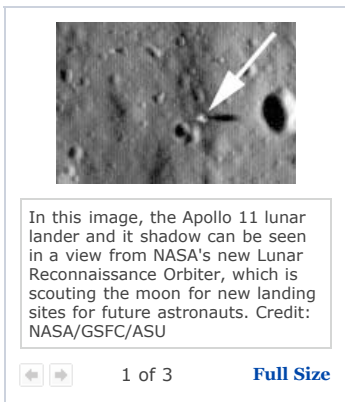
In this image, the Apollo 11 lunar lander and its shadow can be seen in a view from NASA's new Lunar Reconnaissance Orbiter, which is scouting the moon for new landing sites for future astronauts.

The images of these sites are expected to show scientists how the sites have changed since the astronauts trod across them, whether there are any new craters and how the leftover human artifacts