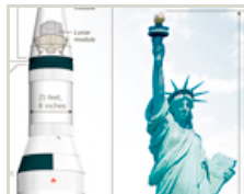
Graphic: Reaching the moon

» Photos: Apollo program in Southern California