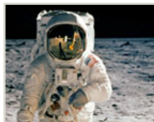
Photos: 40th anniversary of...

Events to mark the anniversary and commemorate the ever-thinning ranks of space-race veterans will include interviews with surviving Apollo astronauts and a Kennedy Center salute to the Apollo era.