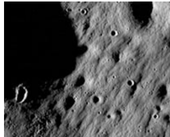
This image shows a cratered region near the moon's Mare Nubium region.

NASA's Lunar Reconnaissance Orbiter, or LRO, has transmitted its first images since reaching lunar orbit June 23. The spacecraft has two cameras - a low resolution Wide Angle Camera and a high resolution Narrow Angle Camera. Collectively known as the Lunar Reconnaissance Orbiter Camera, or LROC, they were activated June 30.