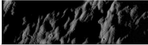
This locator image gives context to the two pictures above.

LRO will help NASA identify safe landing sites for future explorers, locate potential resources, describe the moon's radiation environment and demonstrate new technologies.