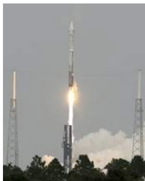
An Atlas V rocket lifts off from Cape Canaveral Air Force Station on Thursday.

ON THE WEB The Flame Trench: Space team blog