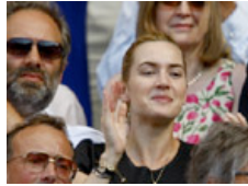
Kate Winslet watches match between Murray and Ferrero at Wimbledon