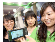
Expo on geographic information applications kicks off in Beijing