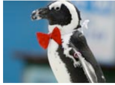
Penguins: Let's dance!