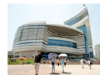
China Science and Technology Museum free of charge