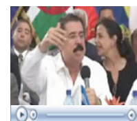
Ousted president Zelaya says will return to Honduras