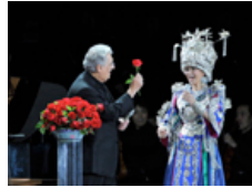
Bird's Nest Summer Concert held at National Stadium