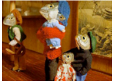
Bizarre fish head art turns your heads