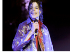
Michael Jackson's photos during last rehearsal released