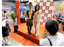
$585,396 worth of gold dressing showed in China's Chongqing