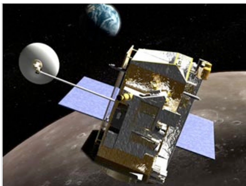
NASA's Lunar Reconnaissance Orbiter is kick-starting a volley of robot craft that will explore the Moon prior to a human return.

A powerful robotic lunar scout, NASA's first in more than a decade, arrived at the moon early Tuesday on a mission to seek out potential landing sites and hidden water ice for future astronauts.