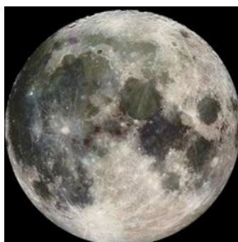
This NASA file image taken by the Galileo spacecraft shows the Moon. NASA blasted two probes into space ...

By MARCIA DUNN, AP Aerospace Writer - Thu Jun 18, 7:30 pm ET