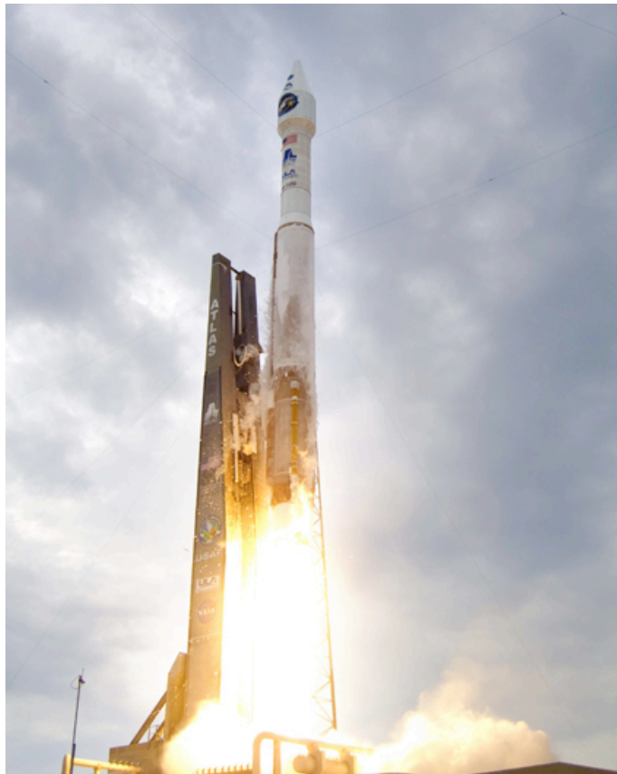
Image above: NASA's LRO and LCROSS spacecraft on top of the Atlas V rocket launch from Complex 41 on Cape Canaveral Air Force Station.