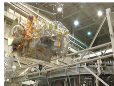
This video shows the Lunar Reconnaissance Orbiter entering the Thermal Vacuum Chamber at NASA's Goddard Space Flight Center in Greenbelt, Md. > View video

The orbiter will be shipped to NASA's Kennedy Space Center in Florida early next year to be prepared for its April 24 launch aboard an Atlas V rocket. Accompanying the spacecraft will be the Lunar Crater Observation and Sensing Satellite, a mission that will impact the moon's surface in its search for water ice.