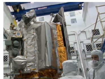
› View an LRO testing music video

In late August, the spacecraft will begin approximately five weeks of thermal vacuum testing, which duplicates the extreme hot, cold and airless conditions of space. During the test, engineers will operate the orbiter and conduct simulated flight operations while the spacecraft is subjected to the extreme temperature cycles of the lunar environment.