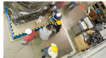
LRO enters Goddard's vibration chamber.

NASA's Goddard Space Flight Center is building and managing the Lunar Reconnaissance Orbiter for NASA's Exploration Systems Mission Directorate in Washington.